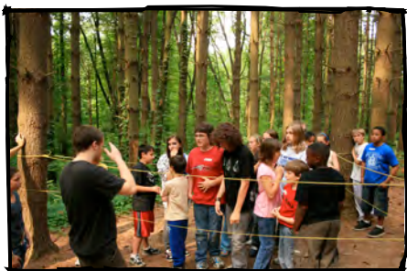
Campers complete a Challenge Course activity

The challenge course was indeed a success. Everyone had fun and had their team skills strengthened.