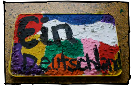
A piece of the OFLA Berliner Mauer